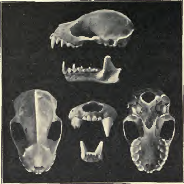
FIG. LXXIV. URODERMA VALIDUM . VALID BAT. Enlarged 1\frac{1}{2} times. Nose view enlarged 2\frac{1}{2} times.

molar and first molar, 8; length of upper molar series, 9; inside length of first upper molar, 4.5; width of crown, 3; inside length of second molar, 4; length of mandible, 21; length of lower molar series, 11; alveolar length of first molar, 3; alveolar length of second molar, 2.5; height from lower border of ramus to top of coronoid process, 9.5; width of condyle at level of alveolar border of ramus, 7.